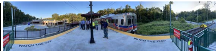
September 2022 Tour of SEPTA WAWA Line & Station

Download the PAC contribution form to support the PSPE Political Action Committee.