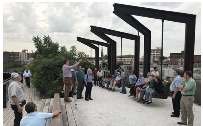
Chapter Tour of Rail Park on September 5th

NOT every student of a Club may advance to be in the competition in February. Perhaps not one student will advance from a specific school due to budget or other considerations. But the Clubs still encourage our young people to embrace Math and someday to consider a career in engineering or affiliated fields.