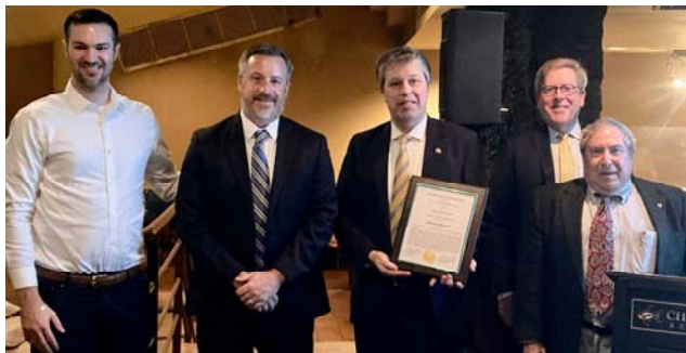
OEA Award Presentation from 2023 Banquet

Presentation of MathCounts and STEM Awards