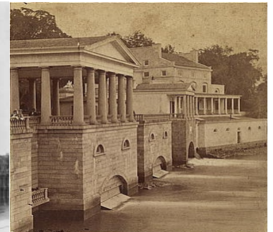
Philadelphia City Hall and Fairmount Water Works