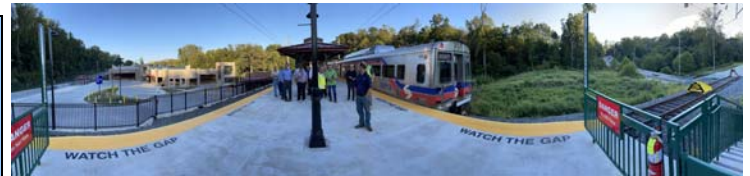
September 2022 Tour of SEPTA WAWA Line & Station